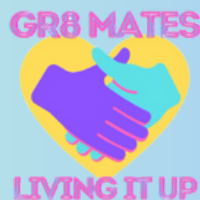
Gr8 Mates Staff and Volunteers