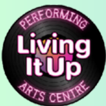
PAC Staff and Volunteers