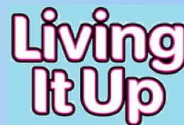
Events Staff and Volunteers