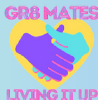
Gr8 Mates Staff and Volunteers