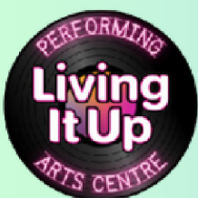
PAC Staff and Volunteers